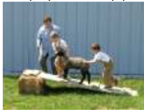
Too bad this wasn't a goat.