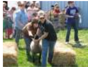
Older kids with larger sheep in the sheep Olympics

Exhibits, demos and displays included sheep wool and crafts, spinning supplies, fiber animal exhibits, working sheep dog exhibits, sheep breed displays, sheep associations, sheep shearing demos, spinning, knitting and weaving, antique tractor displays, and the Illinois Meat Goat Producers info table with a goat pen display beside it.